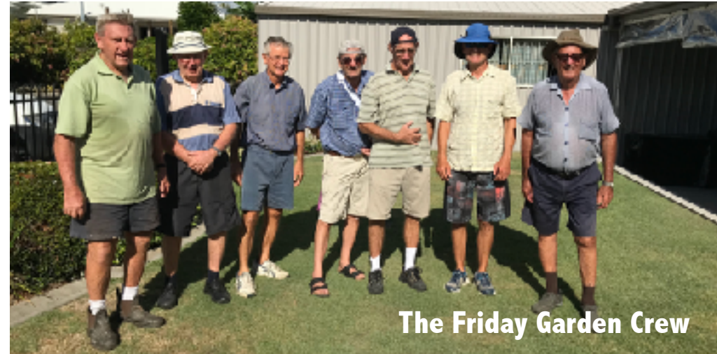
The Friday Garden Crew

These are the fellas you need to thank for faithfully turning out each week over the Summer to assist in maintaining our building and grounds. It's been hot work, and so we appreciate their efforts. Thanks fellas.